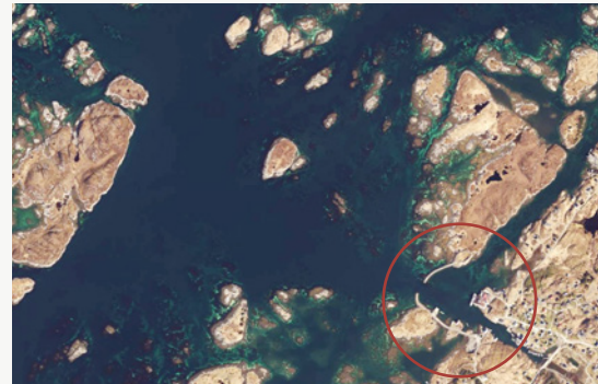
Aerial view of the Dyrnesvågen area with harbour and breakwater in the lower right corner.

transit time, thereby increasing the time available for activities ashore or in the archipelago.